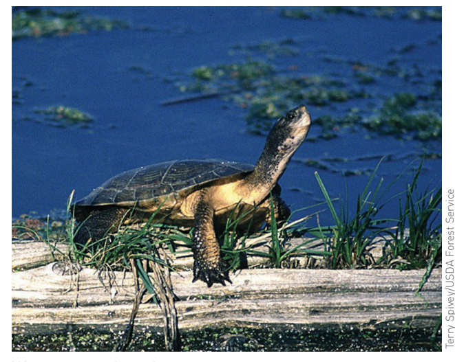
Western pond turtle

ducted cooperatively, with federal, state and non-profit organizations participating with the landowner. This management can preclude or remove the need to list a species under the Endangered Species Act. Landowners also have the option of ensuring long-term protection of listed species and their habitats by establishing conservation easements through NRCS and Farm Bill programs.