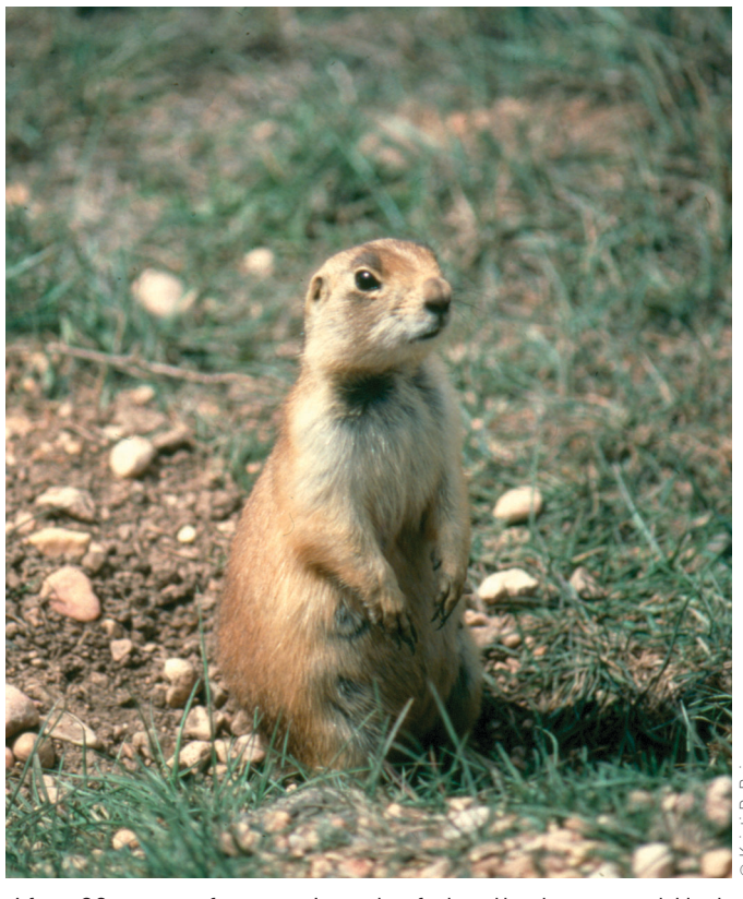
After 22 years of protection, the federally threatened Utah prairie dog has new opportunities for recovery. The best remaining habitat is on private land.

also implement a prescribed grazing plan to maintain the restored vegetation and encourage a reintroduced prairie dog colony. The Leopold Stewardship Fund, which is administered by the Sand County Foundation and Environmental