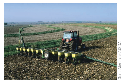
No-till planting of corn.

Under no condition does a onesize-fits-all approach to cost-share rates do justice to the differences between needed assistance. Uniformly lowering (or raising) cost-share rates is not a substitute for fitting the assistance to the need. A 50% cost-share paid for conservation tillage every year for a decade is no bargain when a $2-$3 per acre incentive payment for two years would suffice to overcome reluctance to adopt a practice that has a "negative" cost (i.e., that makes money for the farmer). Paying half the cost of a $50,000 manure storage system is not a conservation bargain if a loan guarantee with no eventual cost would persuade the farmer to invest in it. Similarly, reducing cost-share to 50% for